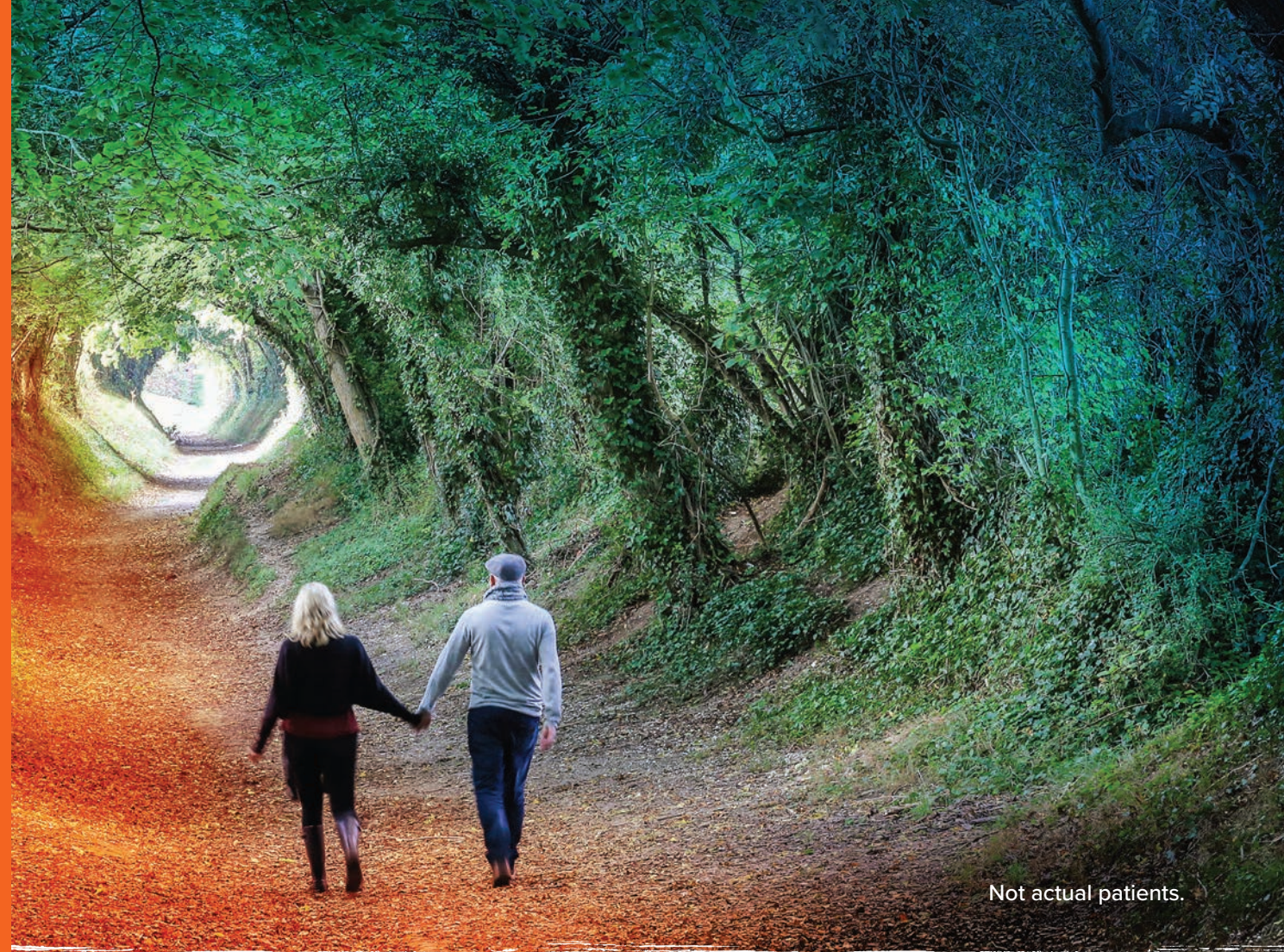
Not actual patients.

This guide is intended to help you throughout your experience as a caregiver. It will also help you understand more about treatment with MONJUVI and how you can best support the person you care for along the treatment journey.