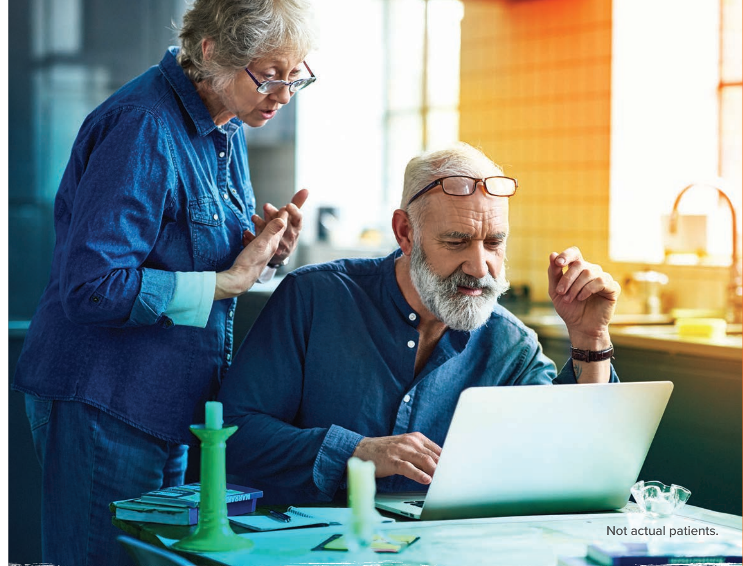
Not actual patients.

The person you're caring for has been given a Treatment Journal. This piece will help you both keep track of any infusion-related side effects that may occur. You can also make notes on emotional and physical well being, among other things.