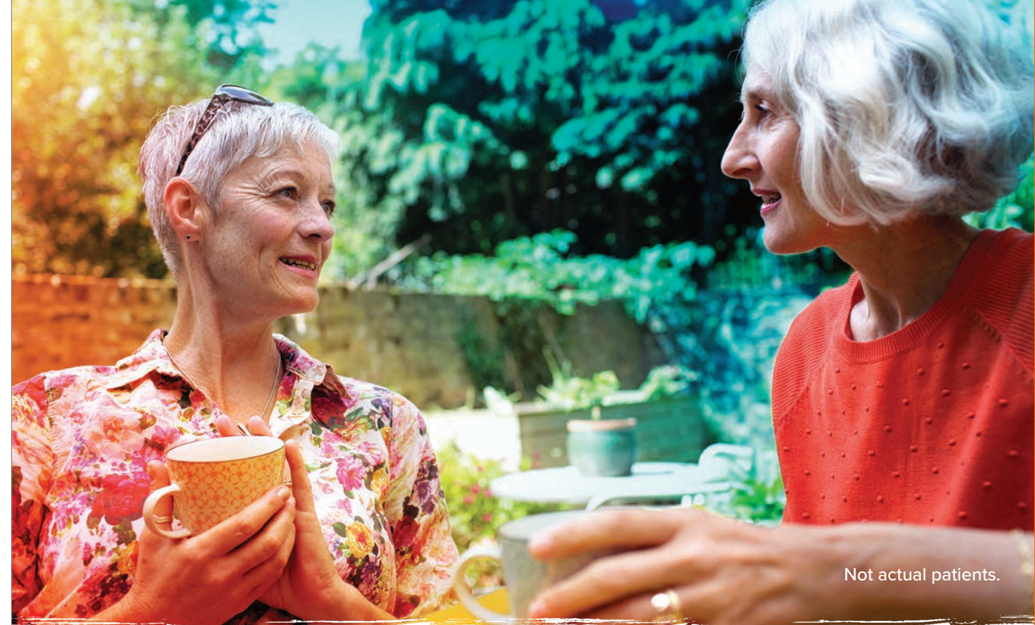
Not actual patients.

4 Please see the full Prescribing Information , including Patient Information, for additional Important Safety Information.