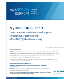
My MISSION Support Brochure