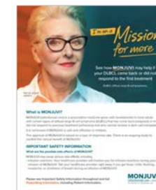
MONJUVI Patient Brochure

The following patient resources on MONJUVI.com may be useful as you assist someone who is receiving MONJUVI.